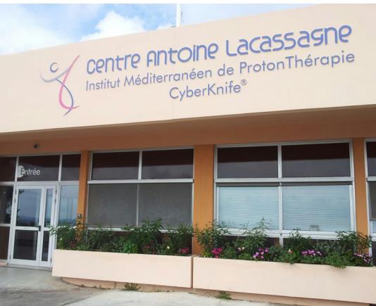
Centre Antoine-Lacassagne (CAL) in Nice, France

A new proton therapy center at Centre Antoine-Lacassagne (CAL) in Nice, France, will soon begin treating patients with IBA's ProteusOne system and the RayStation® treatment planning system. The facility is one of only two proton therapy centers in France, and the first in Europe with the ProteusOne, IBA's compact pencil beam scanning proton therapy system.