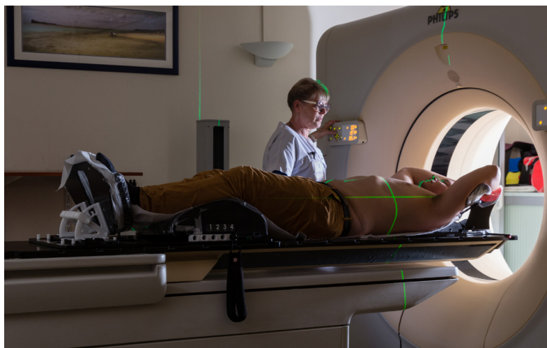
RayPlan offers outstanding compatibility with linacs, oncology information systems, and third-party QA.